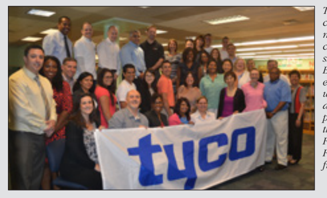
The Tyco volunteer committee loves JA so much that they even created a song that was shared at our Annual Board Meeting. Their employees spend time with students in schools, at our Capstone programs, and through the Central Women's Future Leadership Forum. This photo is from their JA Day event.