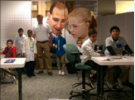
Here, a JA volunteer helped his team of students run their STEM BizTown business in the Quest Diagnostics storefront. In addition to Quest being a branding partner of JA BizTown, they enjoyed volunteering in the classrooms, sharing their world of work and